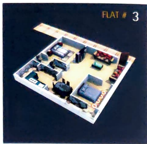
FLAT # 3