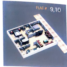
FLAT # 9,10