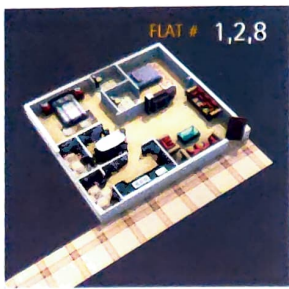
FLAT # 1,2,8