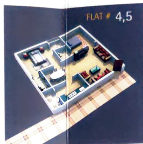
FLAT # 4,5